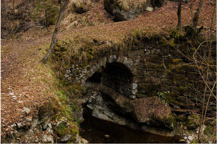
Farra d'Alpago – Roman bridges