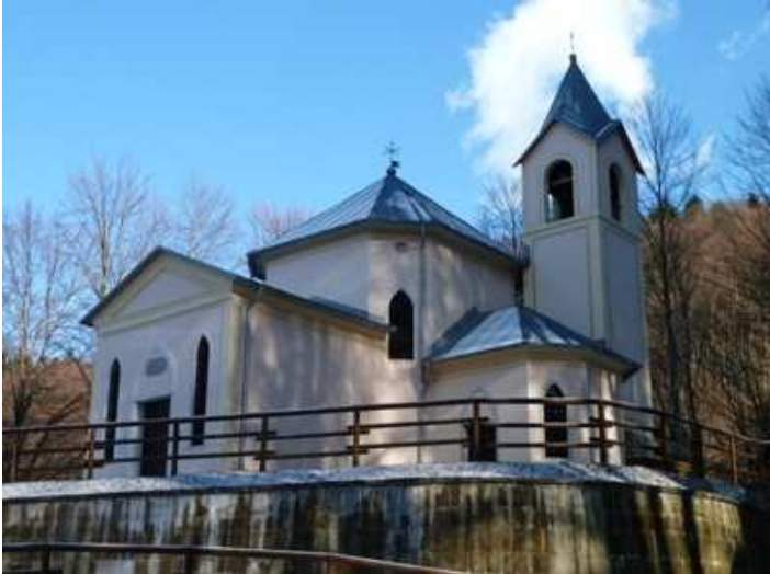
Farra d'Alpago - Sanctuary Madonna del Runal