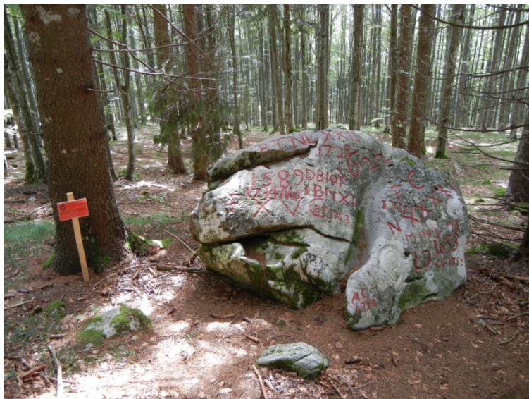
Serenissima Repubblica of Venezia Boundary stones "cippi" along the path