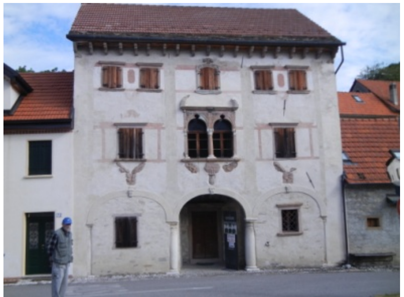
House of the Alchemist

Leaving from the square of Tambre the actual trail starts in Brolio and from the fractional square you take the old dirt road to Valdenogher. Leaving on your left the fountain of Pala, village abandoned after the 1966 flood, you get to the fork in the road leading to Benedet, another abandoned village, you continue going down until you get to Benedet. Through a small lawn on the left you enter where there once was nothing, in a wild forest. The last ascending bit will get you to Valdenogher, at close distance to the spectacular home of the sixteenth century, where the fascinating world of Alchemy can be discovered. Legend has it that a nobleman condemned to death in Alexandria, Egypt for alchemical practices fled from there and took refuge, thanks to the intervention of the Republic of Venice in this house. has an unusual façade, embellished with a stone low relief decoration, interpreted as symbols related to alchemy. Selected objects, concepts, and alchemical insights of the exhibition are sure to arouse the curiosity of the visitor. Domestic spaces are populated by books, reproductions of images of alembics (distilling vessels) and videos that tell the story of the practice of Alchemy. Your walk back can be done on the normal road for about 500 m until the deviation on the left will get you back on the road you came from. The route is 5 km long and with a vertical drop of about 200 m.