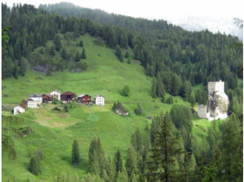
Andraz Castle Livinallongo del Col di Lana