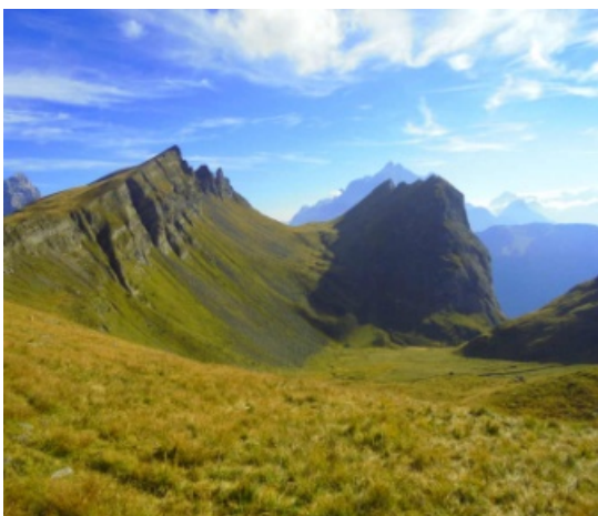
Kingdom of chamois