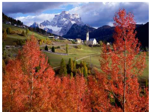
Selva di Cadore with Monte Pelmo