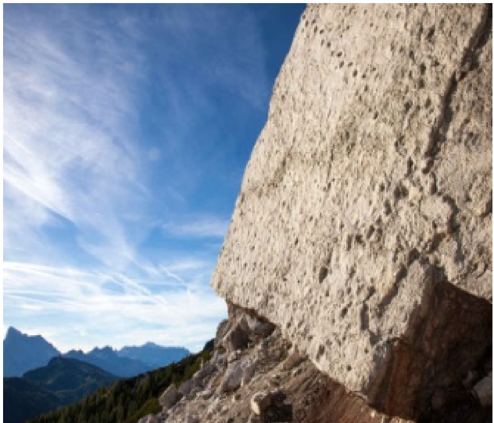
Pelmetto –footsteps of the dinosaurs

From Staulanza pass, take the path n. 472 which runs through the wood along Monte Pelmetto and leads to cross the path that goes up to the rock. The latter is slippery in some sections due to the dirt and gravel ground. From the bottom it is already possible to see the boulder and climbing up towards the wall of Mount Pelmetto, you reach the place of discovery. Here you can see three distinct dinosaur tracks from the Triassic period. This excursion is easy and suitable for the whole family and it is complementary to the visit of the Vittorino Cazzetta museum, in Selva di Cadore, which with its exhibition rooms, guides the visitor to the geological history of the valley: it offers a synthesis, starting from prehistory, of the Val Fiorentina, showing the geological conformation of the Dolomites and guards the skeleton of the "Man of Mondeval", in an intact Mesolithic sepulcher, with a rich funeral equipment, another sensational discovery in 1987 by Vittorino Cazzetta. Valmo, as this Mesolithic man was called, dates back to 7500 years ago and it is the main character of the museum which every year welcomes lots of young students, families and scientists who want to discover more about this ancient valley. Who knows how many other witnesses of the past the land here keeps still undiscovered.